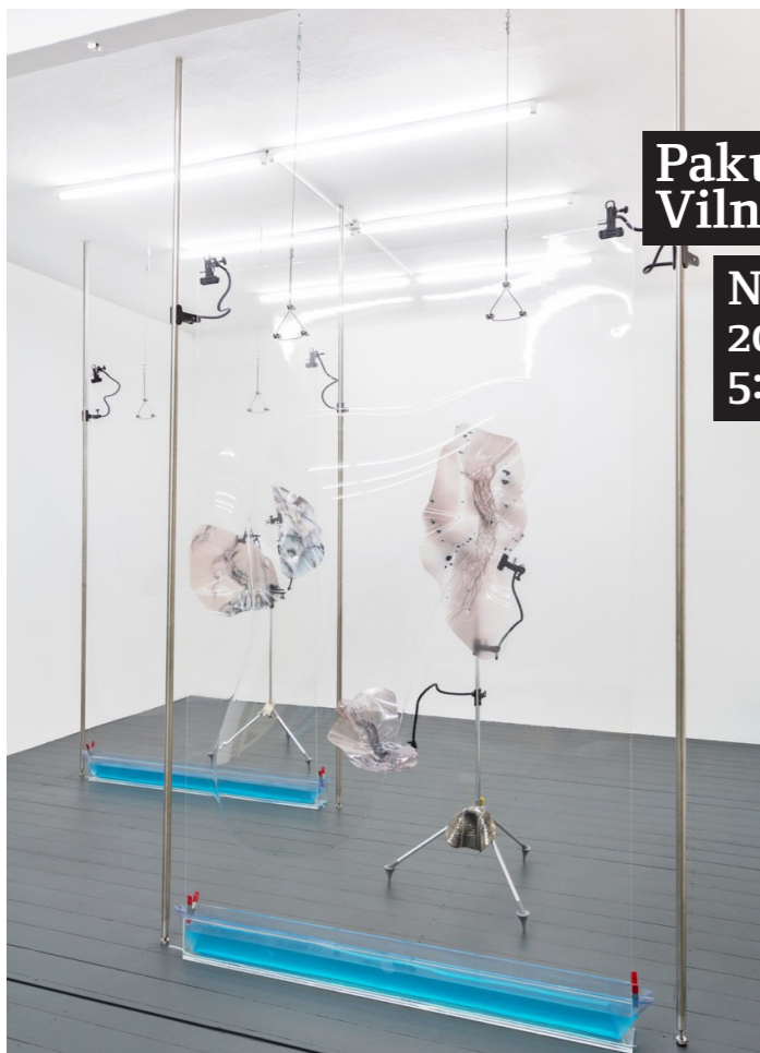
Pakui Hardware, On Demand , 2017, heat-treated plexiglass, stainless steel columns, plexiglass profiles with pvc film held by clamps containing water colored with sky blue edible pigment, uv prints on pvc pentaprint film attached to tripods with spring clamps, ceramics, silicone, size and dimensions variable. Courtesy the Artists, EXILE